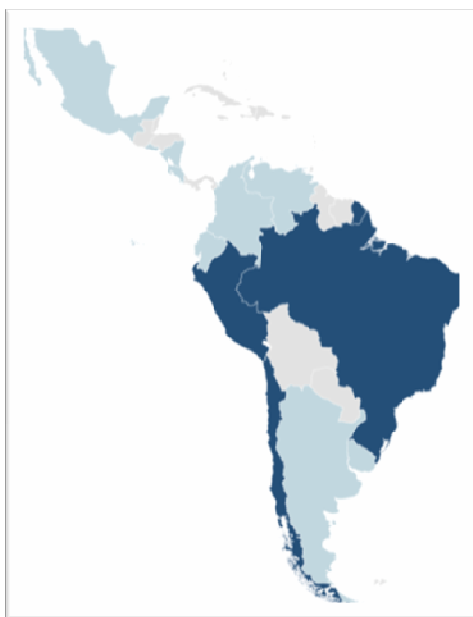
Figure 2: Status on Argentina's eduroam deployment.